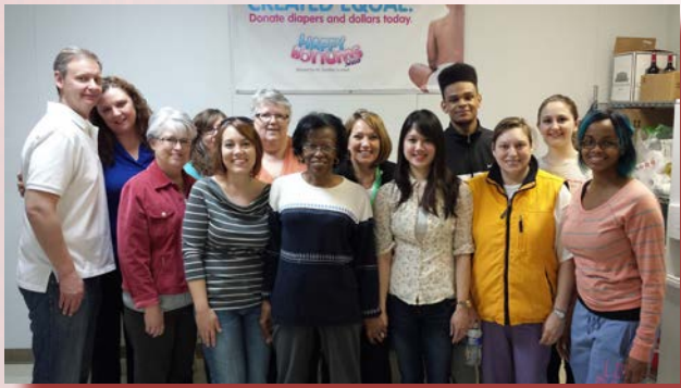
Opportunities for Young Adults