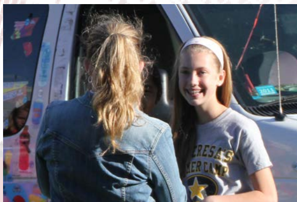
A Vital Youth Ministry