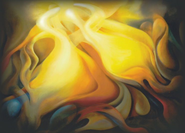
Armando Alemdar Ara, Transfiguration of Jesus , oil on linen, 2004, private collection

The Cathedral Bookstore is open every Sunday, 8:30-10 a.m. and immediately following the 10:15 service. Also open before and after Evensong each month.