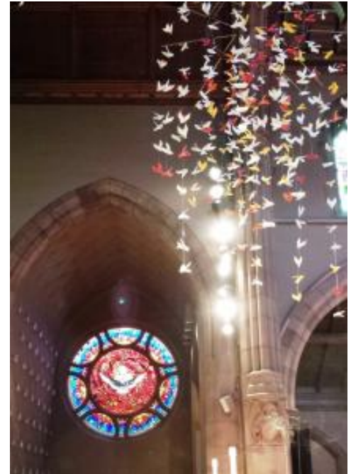
Trinity Church, Hartford, the Episcopal Church in Connecticut.

Almighty God, on this day you opened the way of eternal life to every race and nation by the promised gift of your Holy Spirit: Shed abroad this gift throughout the world by the preaching of the Gospel, that it may reach to the ends of the earth; through Jesus Christ our Lord, who lives and reigns with you, in the unity of the Holy Spirit, one God, for ever and ever. Amen (Book of Common Prayer, p. 227).