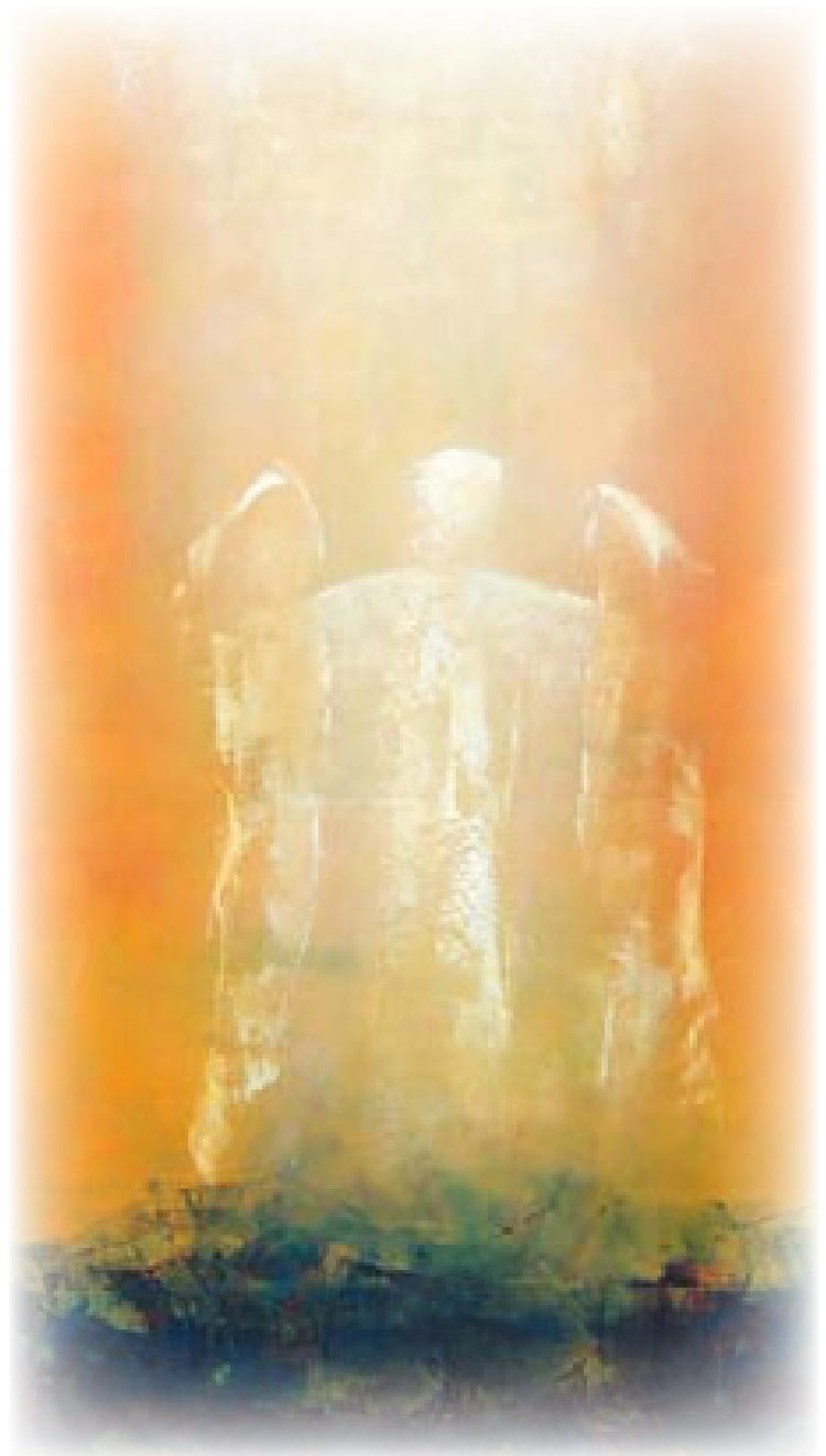
Transfiguration

Jesus took with him Peter and John and James, and went up on the mountain to pray. And while he was praying, the appearance of his face changed, and his clothes became dazzling white. Suddenly they saw two men, Moses and Elijah, talking to him. They appeared in glory and were speaking of his departure, which he was about to accomplish at Jerusalem. Now Peter and his companions were weighed down with sleep; but since they had stayed awake, they saw his glory and the two men who stood with him. Just as they were leaving him, Peter said to Jesus, “Master, it is good for us to be here; let us make three dwellings, one for you, one for Moses, and one for Elijah” —not knowing what he said. While he was saying this, a cloud came and overshadowed them; and they were terrified as they entered the cloud. Then from the cloud came a voice that said, “This is my Son, my Chosen; listen to him!” When the voice had spoken, Jesus was found alone. And they kept silent and in those days told no one any of the things they had seen.