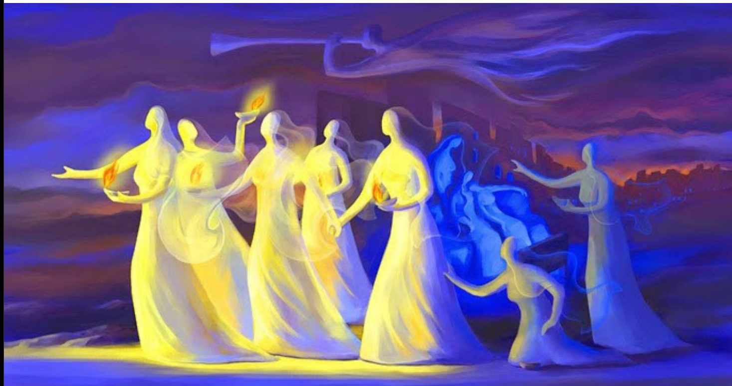
The Parable of the Ten Virgins by Ain Vares