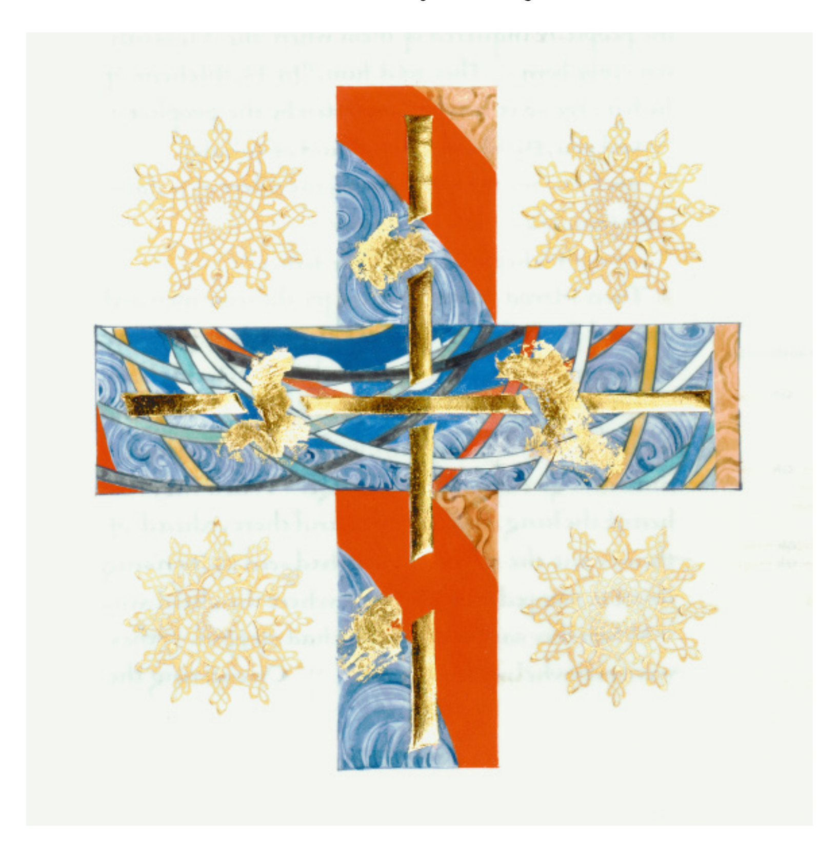
The Third Sunday of Easter April 15, 2018 • 8 a.m.