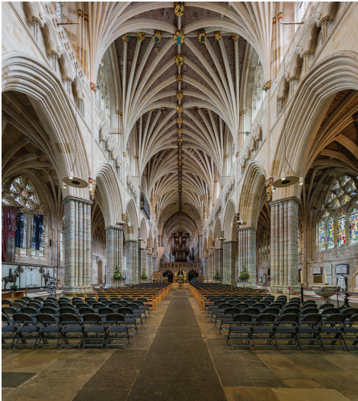
Exeter Cathedral Nave, Exeter, UK.

The Choir arrives in London Sunday morning, July 10 and will go to Exeter via Salisbury. There the choir will sing services daily except Wednesday. On Monday, July 18 they proceed to Norwich and sing services daily except Wednesday. It is quite a responsibility to fill the musical shoes of the Cathedral Choirs, but we are well prepared to do so. We ask for your prayers as we sing our daily services.