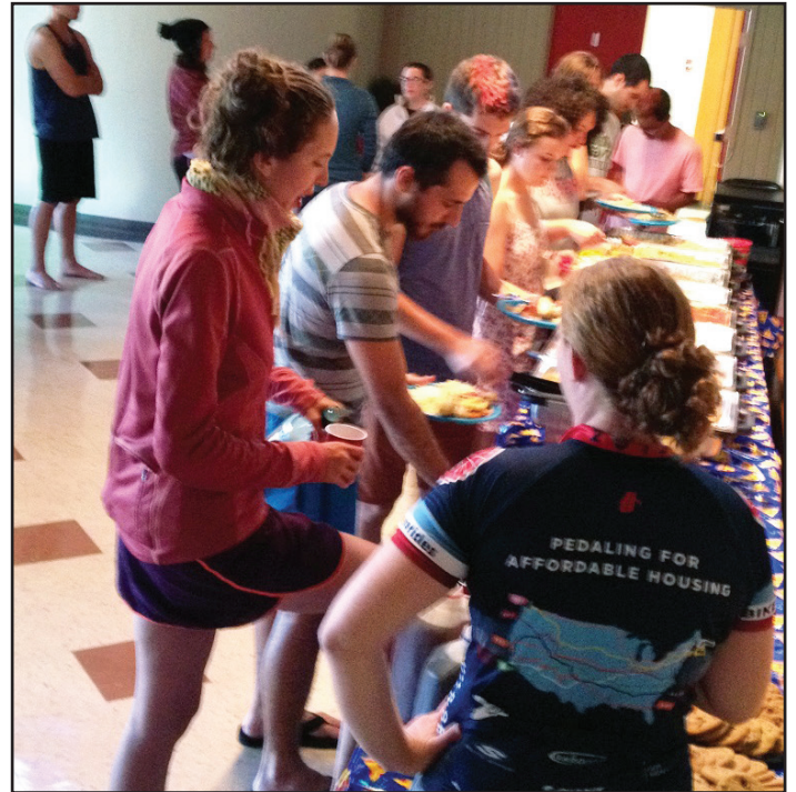
The Cathedral hosted members of the Bike and Build organization for several days in June.