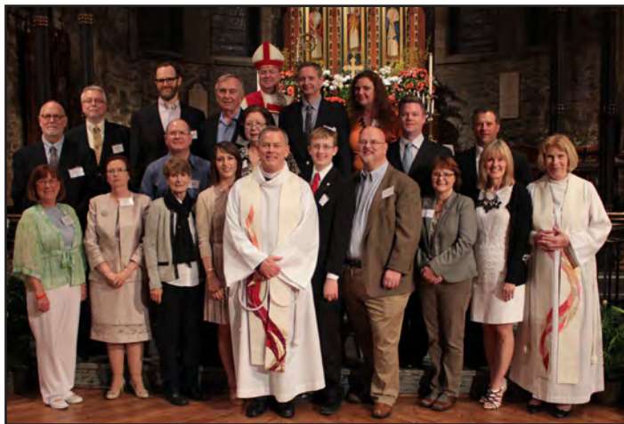
Welcome to the Cathedral!