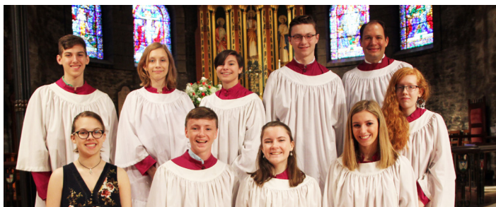
Tallis Singers 2017