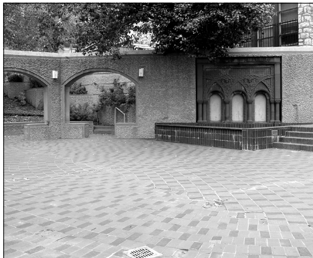
Water in the Diocesan Close does not drain well, which causes water to get into the Diocesan Center and Clergy Sacristy in the Cathedral during heavy rains.