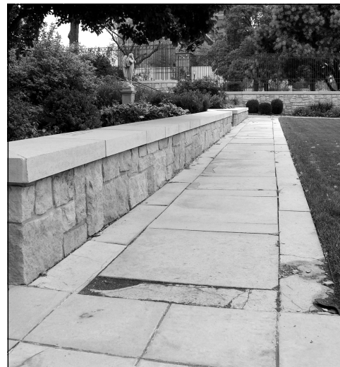
The sidewalk near the Memorial Garden is hazardous and needs repairs.