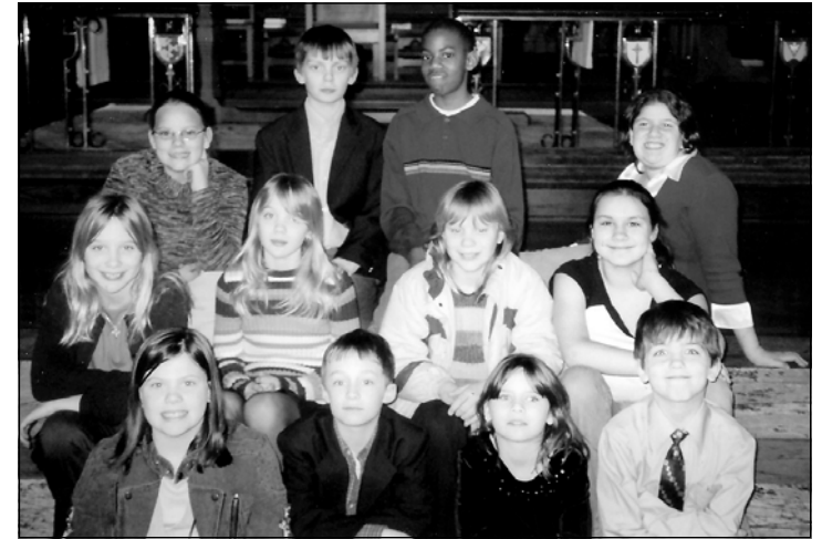
The Grace Choraliers

When asked why they love being in the group, these young musicians responded with answers such as: singing to everyone makes me happy; being with friends; it helped me be a better singer; it's fun and when you sing, it makes you feel good because you are praising God.