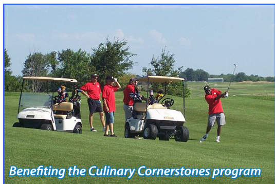
Benefiting the Culinary Cornerstones program

Great Golf, Great Food, Great Fun ... Fore a Great Cause!