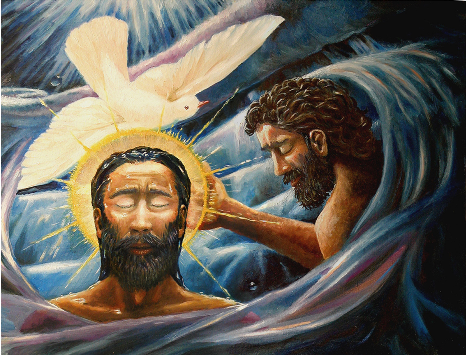
"Baptism of Christ" by Dave Zelenka