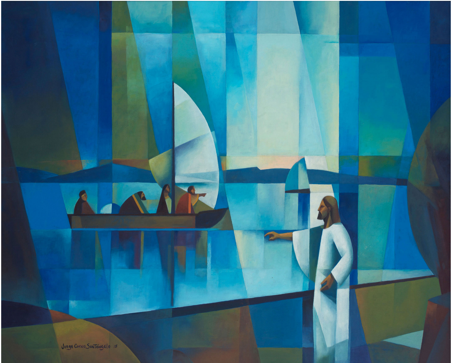
"The Call" by Jorge Cocco Santángelo