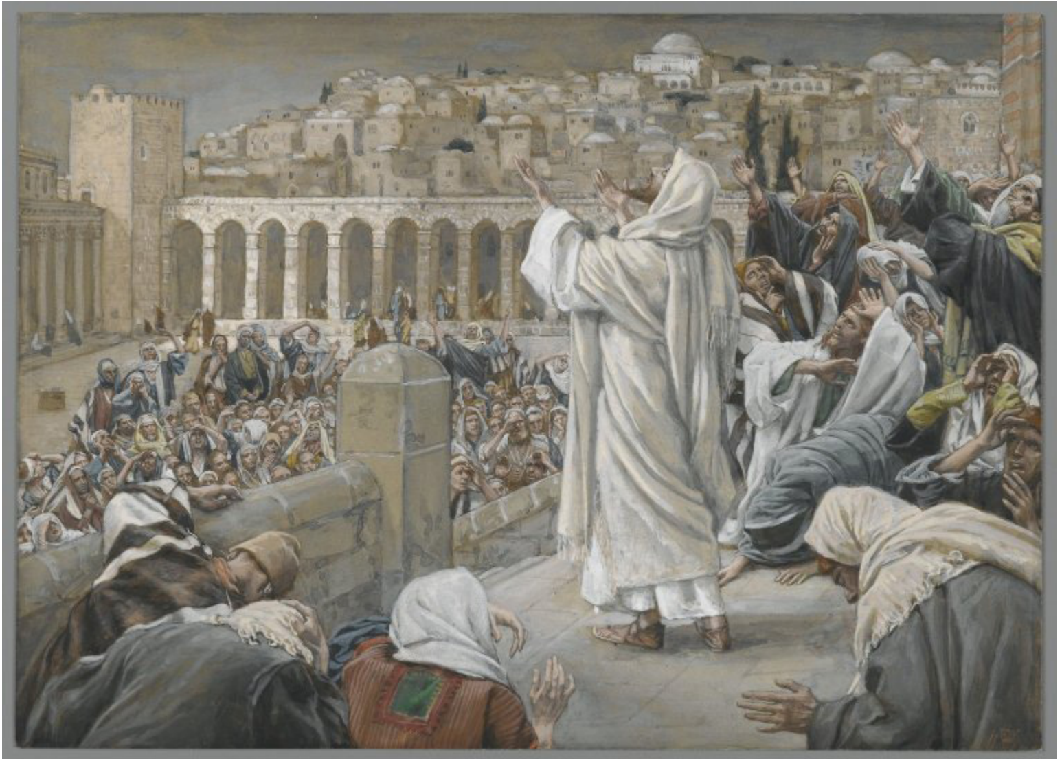
"The Voice from on High" by James Tissot

The Last Sunday after the Epiphany February 19, 2023 • 5 p.m.