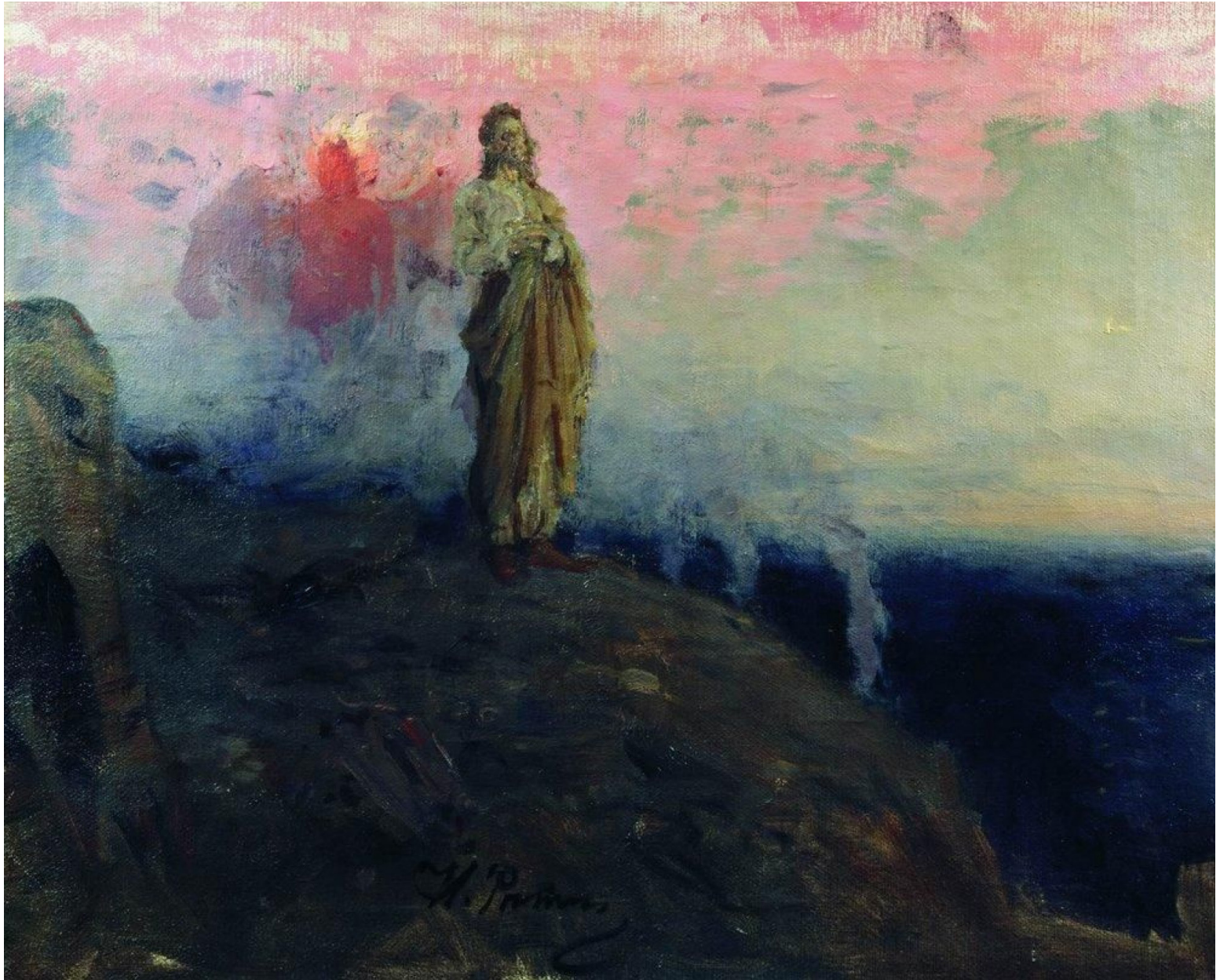
"Follow me, Satan (Temptation of Christ)" by Ilya Efimovich Repin

The First Sunday in Lent February 26, 2023 • 8 a.m.