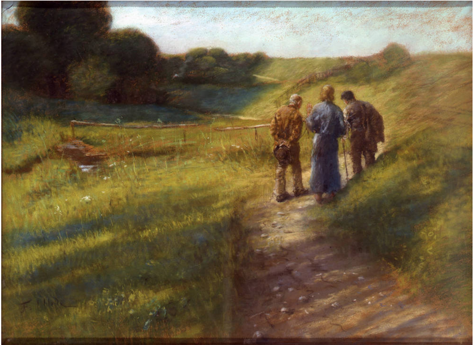
"Der Gang nach Emmaus" by Fritz von Uhde

The Third Sunday of Easter April 23, 2023 • 8 a.m.