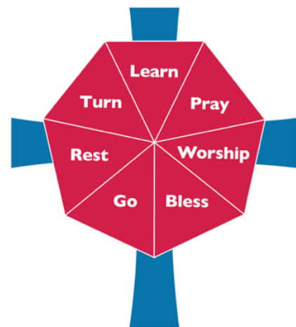
THE WAY OF LOVE Practices for Jesus-Centered Life

Learn more about the Way of Love at episcopalchurch.org/wayoflove . You can find suggestions on getting started and going deeper with Resting at iam.ec/evol .