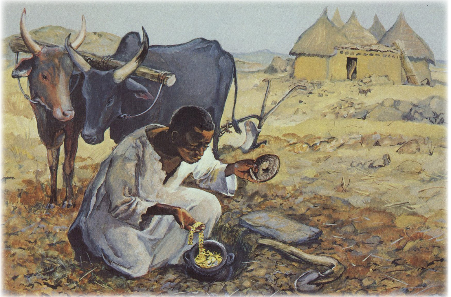
"The Hidden Treasure" by Jesus Mafa, a Christian community in Cameroon, Africa