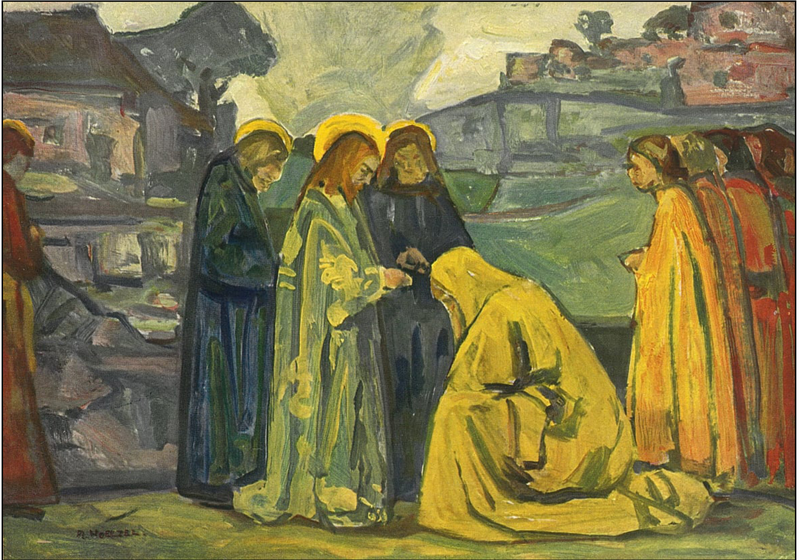
"Christ and the Canaanite Woman" by Adolf Hölzel

The Twelfth Sunday after Pentecost August 20, 2023 • 8 a.m.