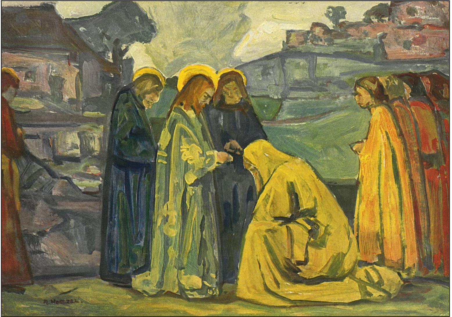
"Christ and the Canaanite Woman" by Adolf Hölzel

The Twelfth Sunday after Pentecost August 20, 2023 • 5 p.m.