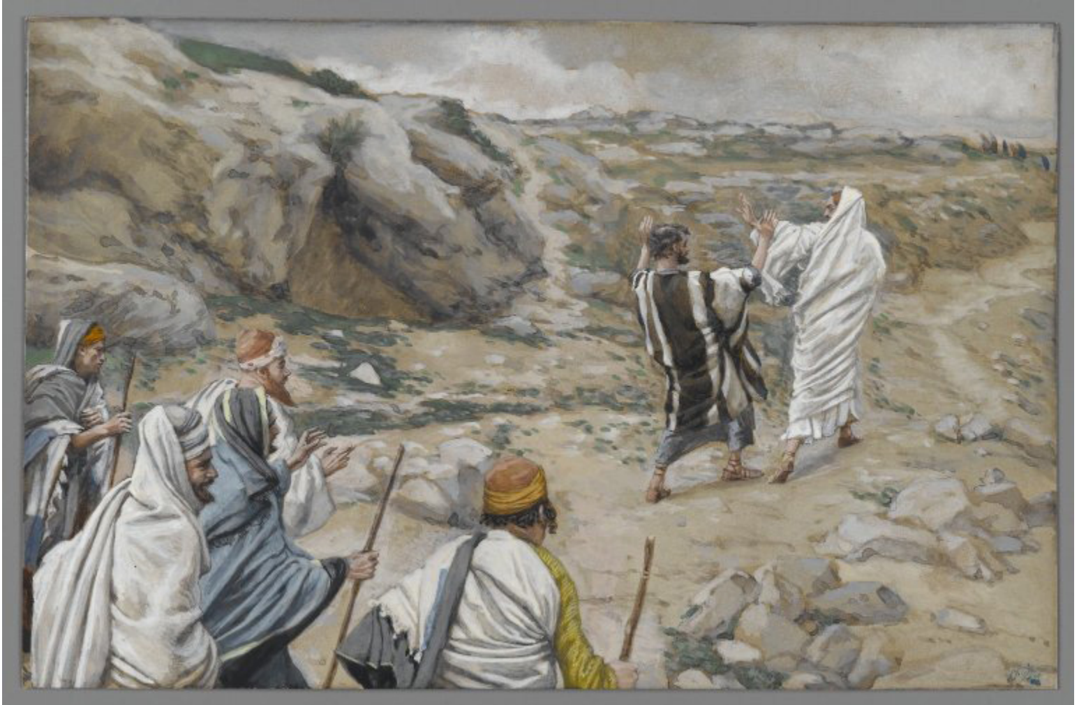
"Get Thee Behind Me Satan" by James Tissot