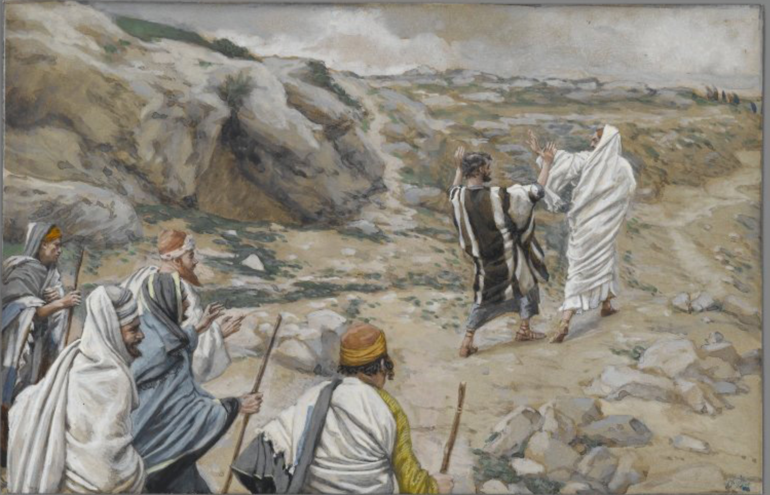
"Get Thee Behind Me Satan" by James Tissot

The Fourteenth Sunday after Pentecost September 3, 2023 • 8 a.m.