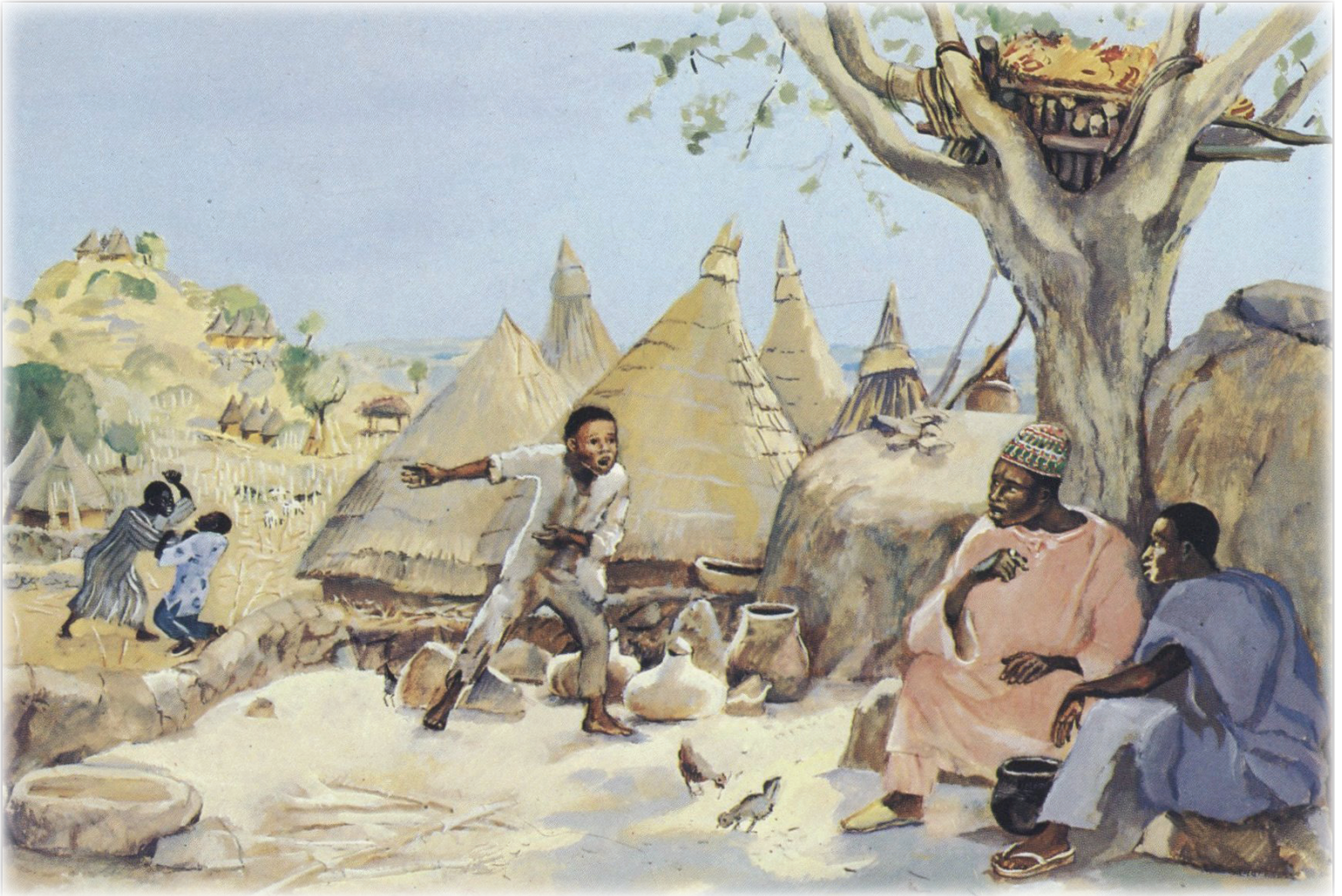
"The Unforgiving Servant" Jesus Mafa by a Christian community in Cameroon, Africa