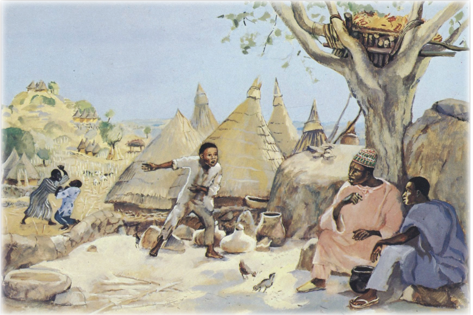
"The Unforgiving Servant" Jesus Mafa by a Christian community in Cameroon, Africa

The Sixteenth Sunday after Pentecost September 17, 2023 • 8 a.m.