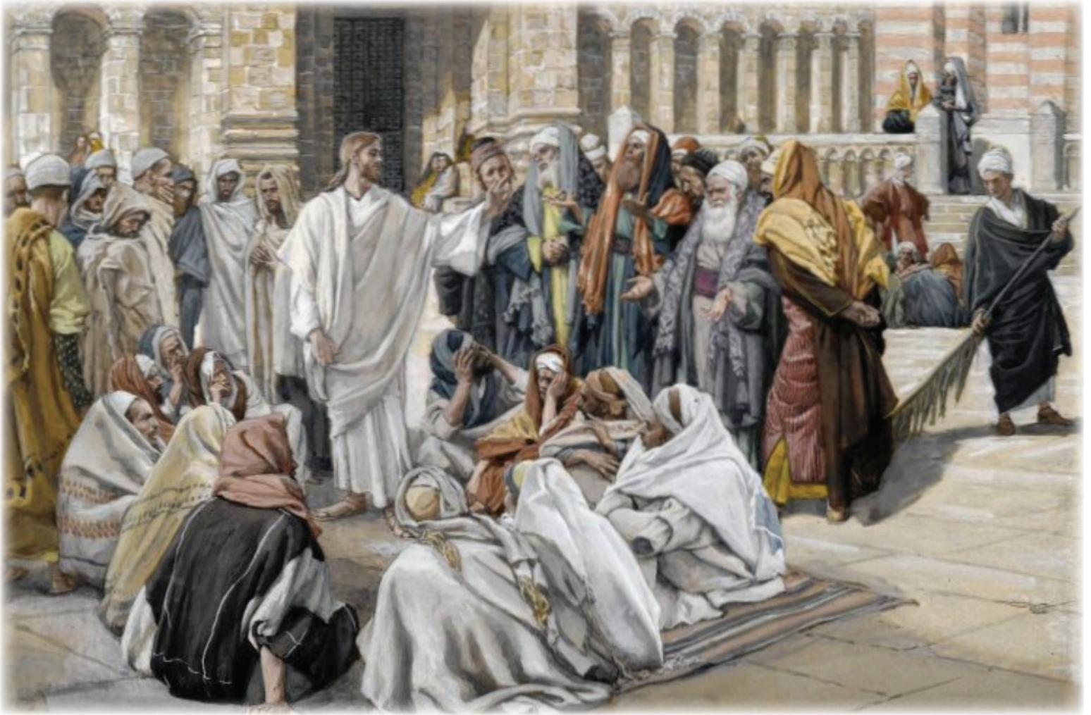
"The Pharisees Question Jesus" by James Tissot

The Sixteenth Sunday after Pentecost September 17, 2023 • 5 p.m.