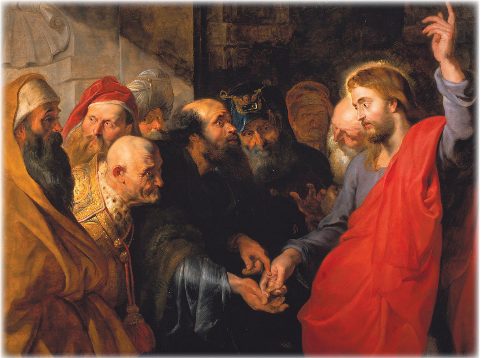
"The Tribute Money" by Peter Paul Rubens

The Twenty-first Sunday after Pentecost October 22, 2023 • 8 a.m.