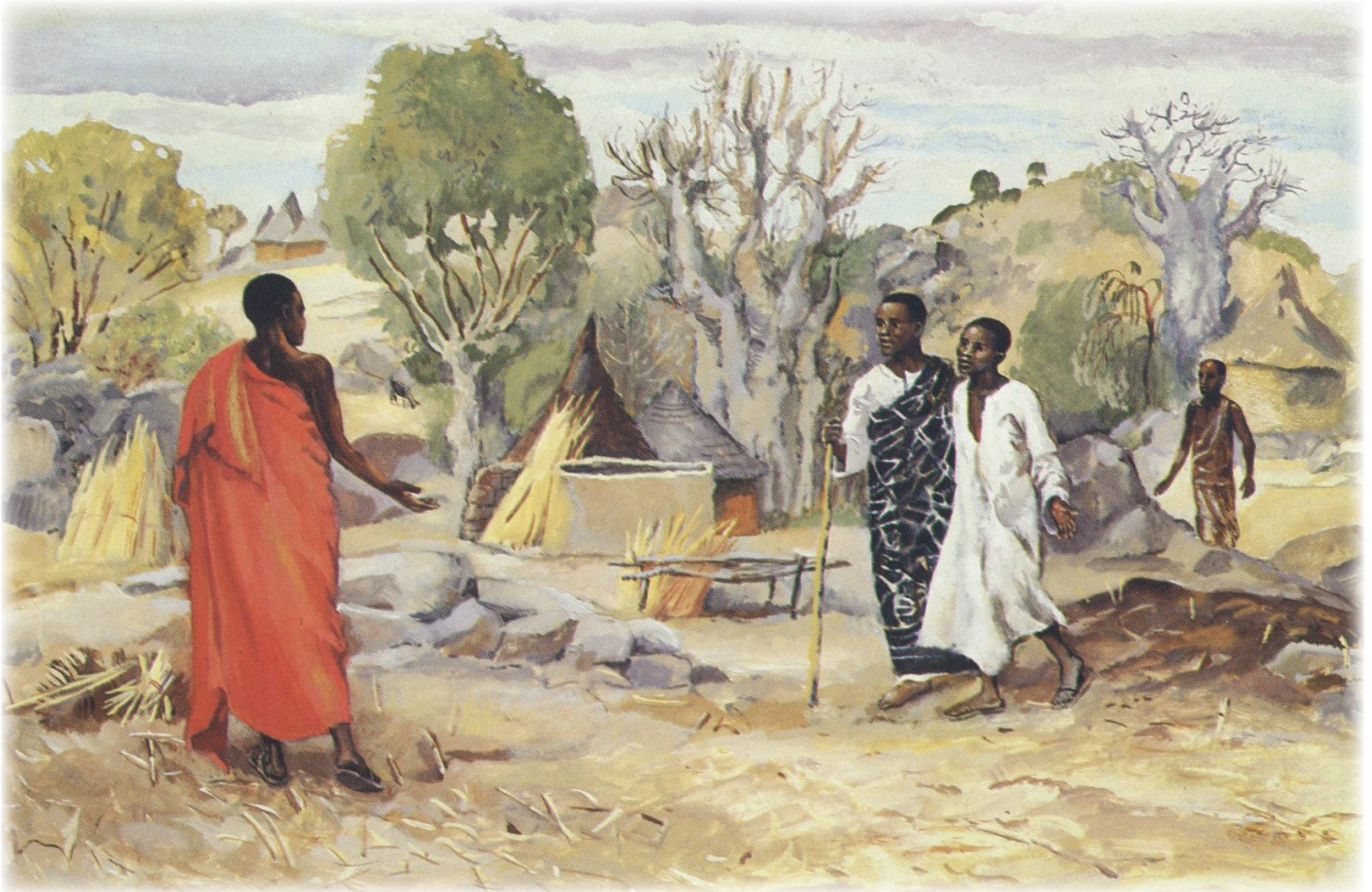
"The first two disciples" by Jesus Mafa by a Christian community in Cameroon, Africa