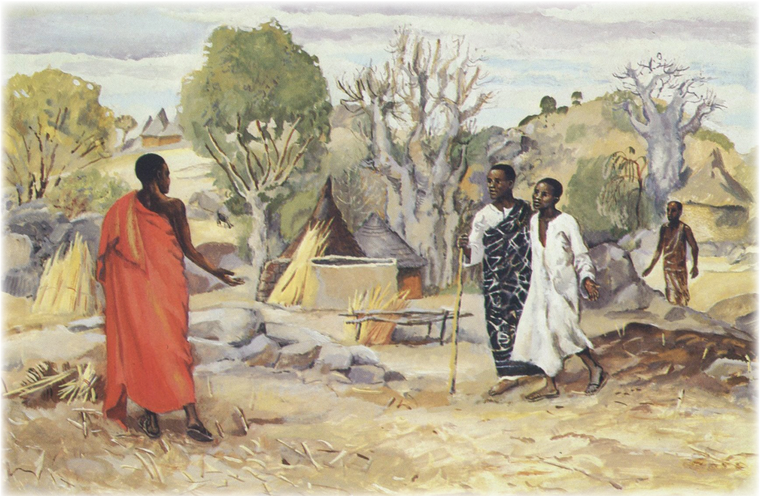
"The first two disciples" by Jesus Mafa by a Christian community in Cameroon, Africa

The Second Sunday after the Epiphany January 14, 2024 • 8 a.m.