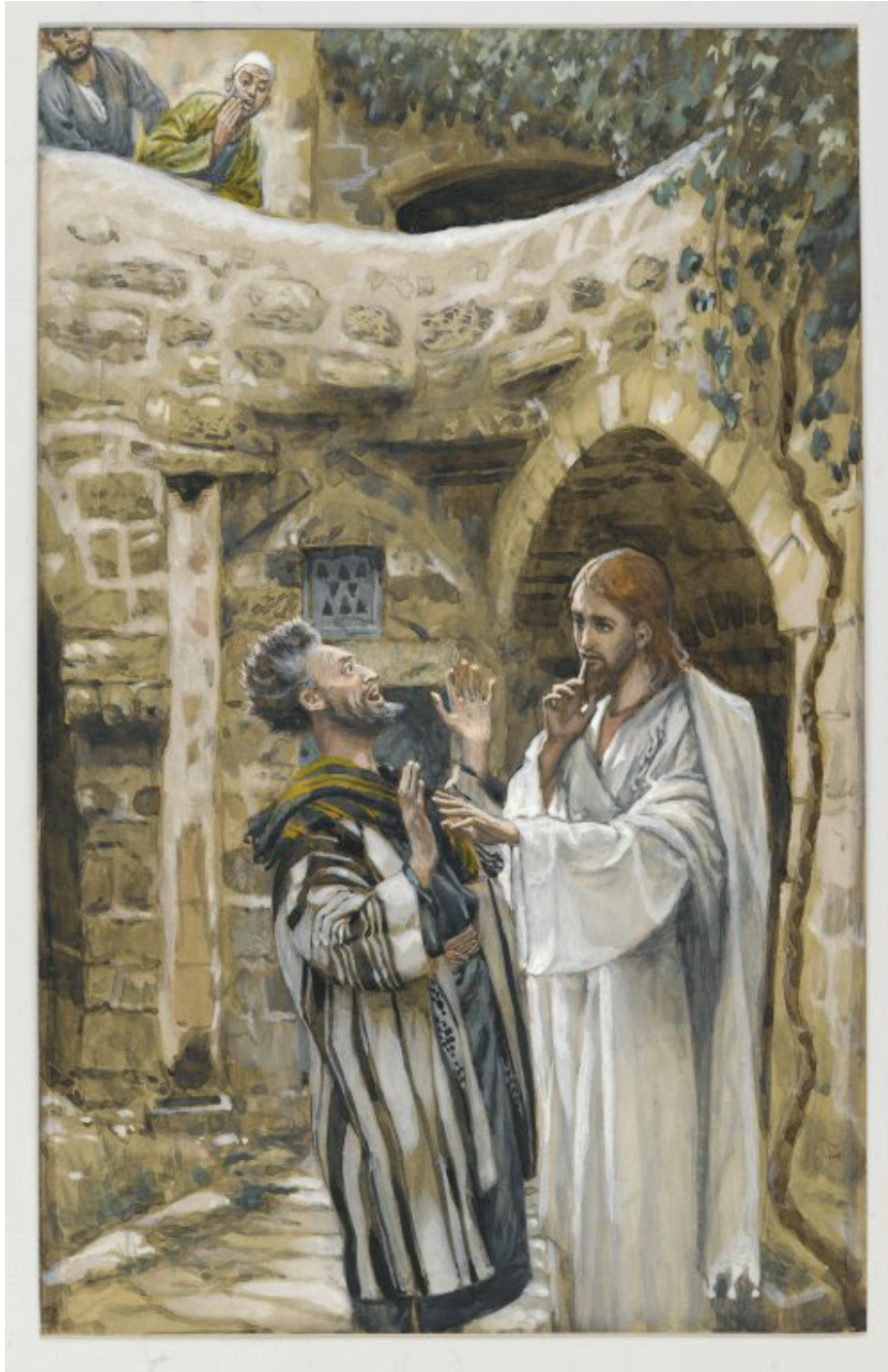
"Jesus Heals a Mute Possessed Man" by James Tissot

CHORAL EVENSONG The Third Sunday after the Epiphany January 21, 2024 • 5 p.m.