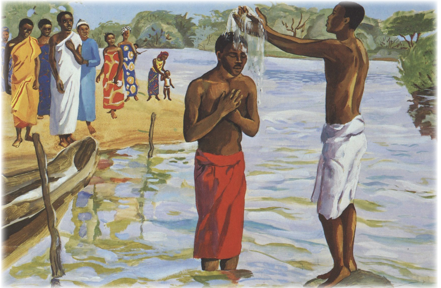
"Baptism of Jesus" by Jesus Mafa by a Christian community in Cameroon, Africa

The First Sunday in Lent February 18, 2024 • 8 a.m.