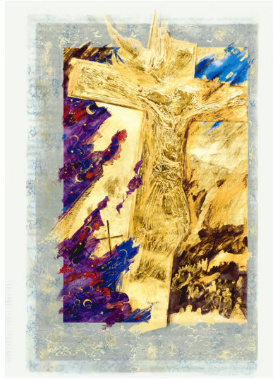
Crucifixion , Donald Jackson, Copyright 2002, The Saint John's Bible , Saint John's University, Collegeville, Minnesota USA. Used by permission. All rights reserved.

March 6—Cultivating Lives of Virtue: St. John's Bible as a guide for spiritual development.