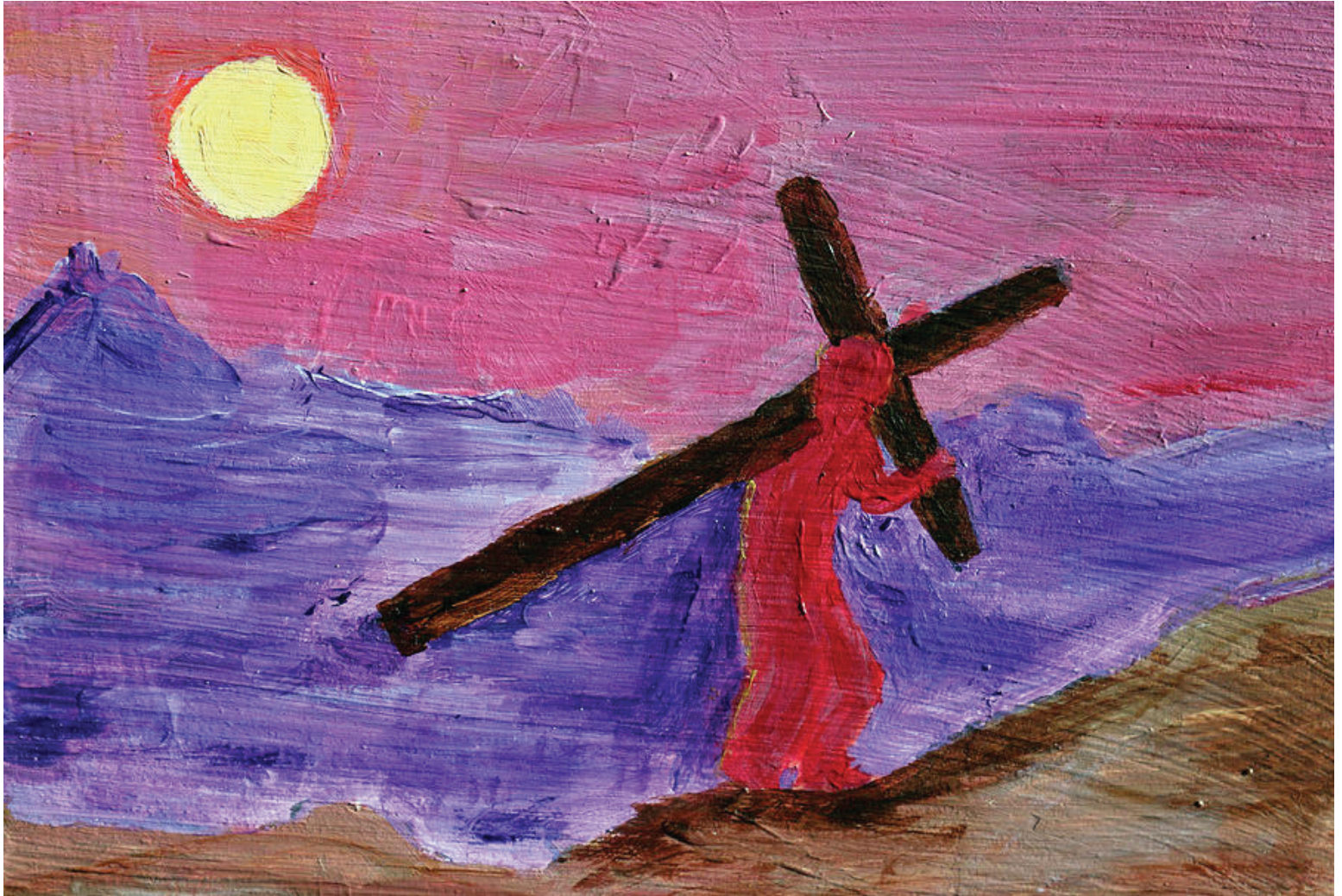
"Take Up Your Cross" by Day Williams

The Second Sunday in Lent February 25, 2024 • 8 a.m.