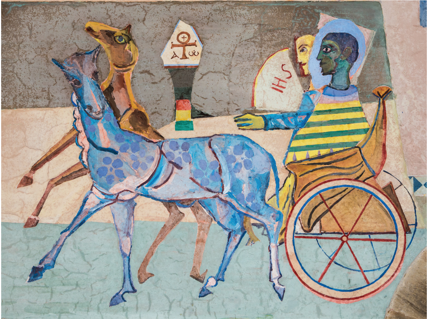
"Philip and the Ethiopian Eunuch" by Herbert Boeckl

The Fifth Sunday of Easter April 28, 2024 • 10:30 a.m.