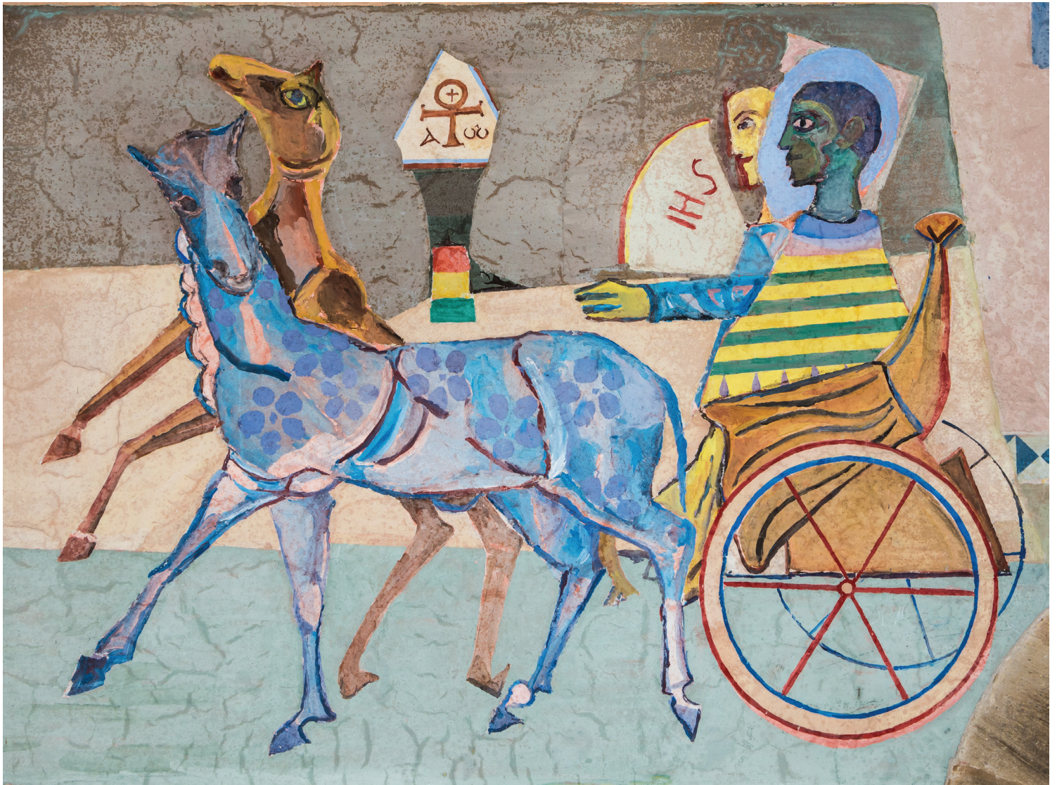
"Philip and the Ethiopian Eunuch" by Herbert Boeckl

The Fifth Sunday of Easter April 28, 2024 • 8 a.m.