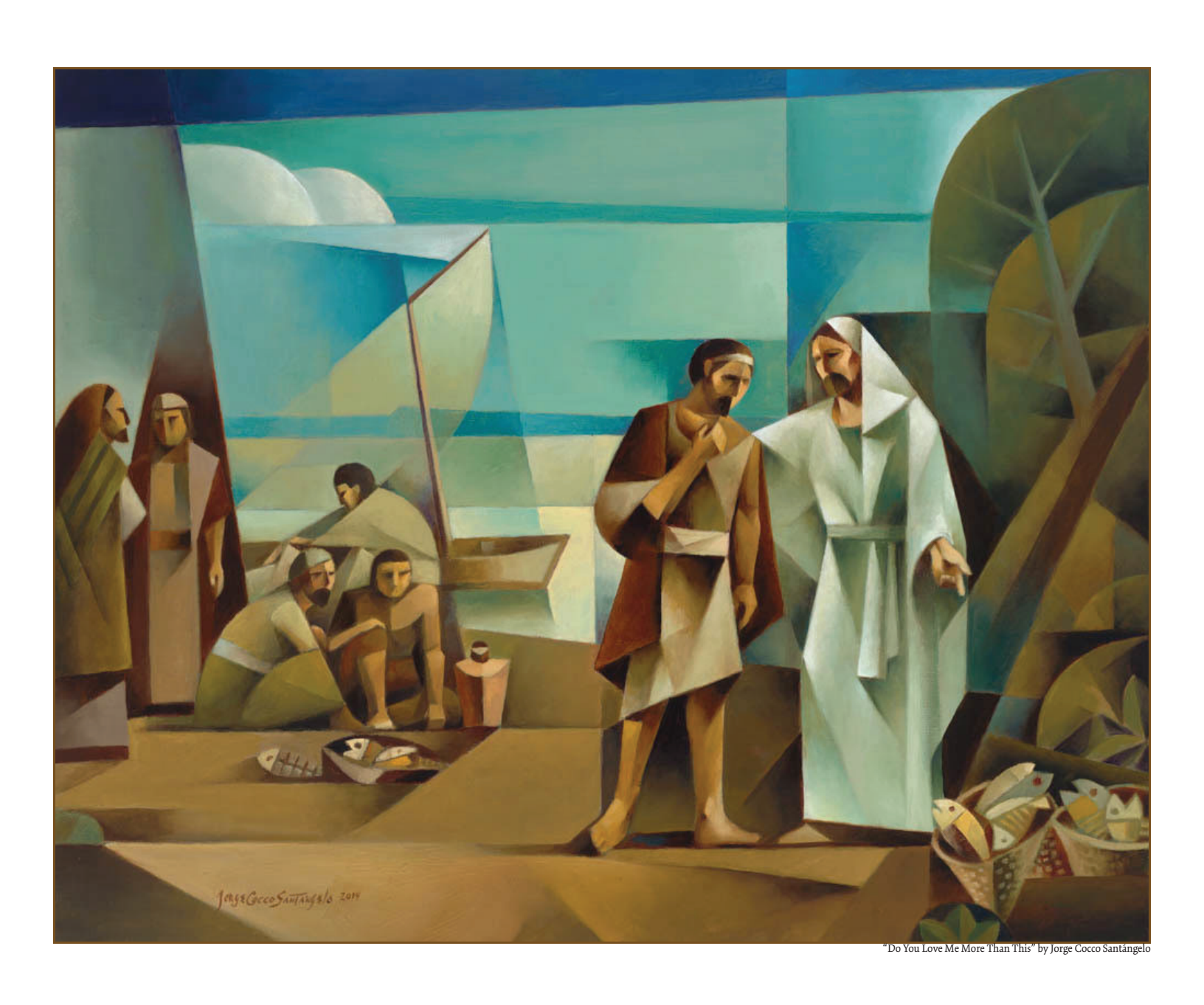
The Third Sunday of Easter