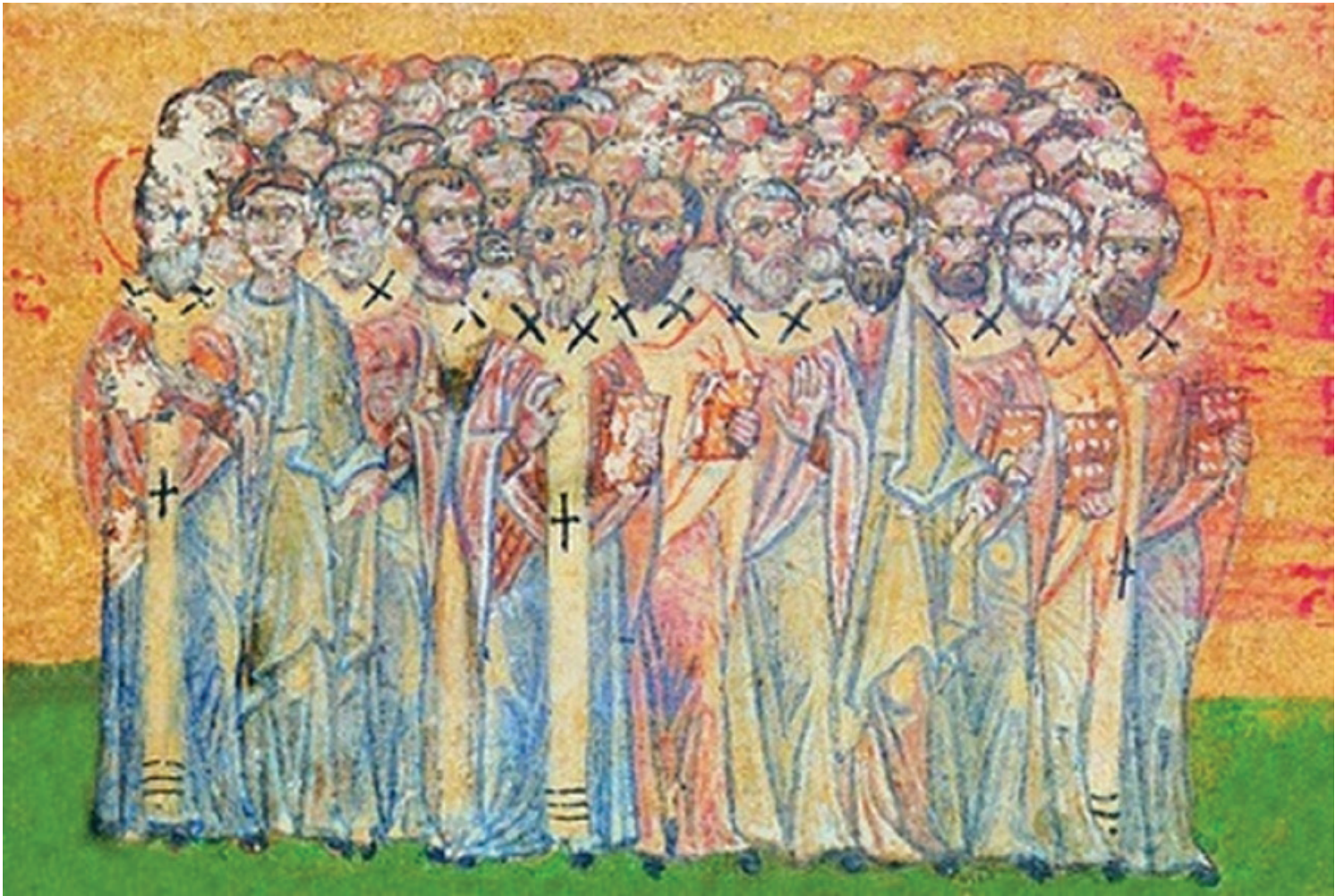
"70 apostolov" (miniature in the Georgian Georgian paintings, XV century)

CHORAL EVENSONG The Seventh Sunday of Easter May 17, 2026 • 5 p.m.